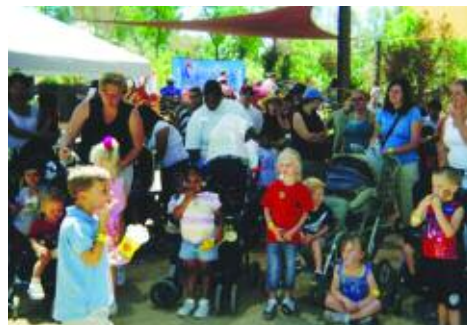
Crowds of attendees surrounded as AzEIP staff presented information and awarded door prizes.

Families with children birth to three years of age with disabilities and delays living in Maricopa, Pinal and Gila Counties recently enjoyed the 4th Annual AzEIP Family Fun Day at the Phoenix Zoo . Over 200 families attended along with 28 vendors and 32 volunteers. Each provider agency planned an activity for the families to enjoy, donated a door prize and had wonderful resources to share. A staff member from the Acacia Branch Phoenix Public Library read stories and gave each child a book to take home. Families also had the opportunity to go on a Zoofari and visit all the animals for a chance to win some great prizes. The AzEIP Program Coordinators are very appreciative of the continued support of the Phoenix Zoo.